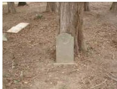
Planter's cemetery at Ames Plantation (partially restored)

Through the efforts of Mr. Jamie Evans, a firm foundation has already been established in the collection and indexing of archival documents and maps. Utilizing archival records in the form of land grants and deeds, a complete land ownership record has been established at Ames Plantation (Evans 2000), thus the locations of the plantations on the modern landscape have already been established. Another Rhodes student, Jay Jordan, used this research to consider changes in land ownership patterns after emancipation (see his full paper: http://www.rhodes.edu/images/content/Academics/Jason_Jordan.pdf ). Allison Brown also used this database to consider the activities of female plantation owners prior to 1860 ( http://www.rhodes.edu/images/content/Academics/Allison_Brown.pdf ).