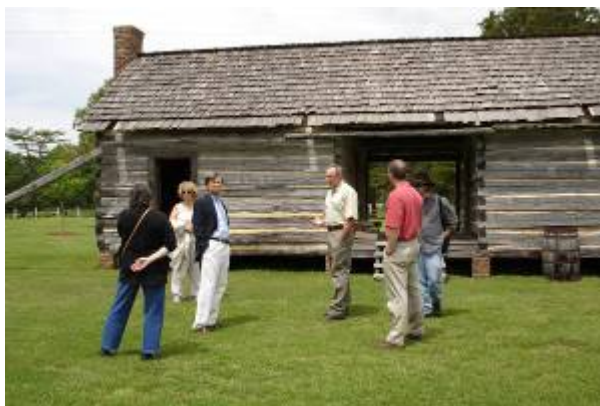
Pres. Troutt, Provost Borst and 3 Rhodes Faculty discuss undergraduate research at Ames with J. Evans

Integrating archaeology and material culture studies into the classroom is a valuable way to introduce undergraduate students to primary research opportunities in Archaeology, History, African-American Studies, Human and Wildlife Ecology and Cultural Geography. This database will allow faculty and students the opportunity to become familiar with several of the research opportunities at the site. Once completed, the website will include annotated photographs, scanned historic documents related to the site, and plot maps that will be linked to the photo database. The website will lay the groundwork for future excavations, and encourage the involvement of interested faculty members from Rhodes and other ACS schools in the development of future research projects and field school seasons at the Ames Plantation.