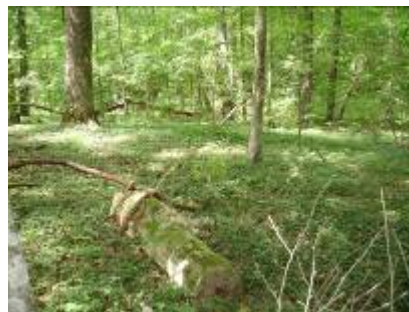
Cemetery site at Ames containing slave and planter burials.